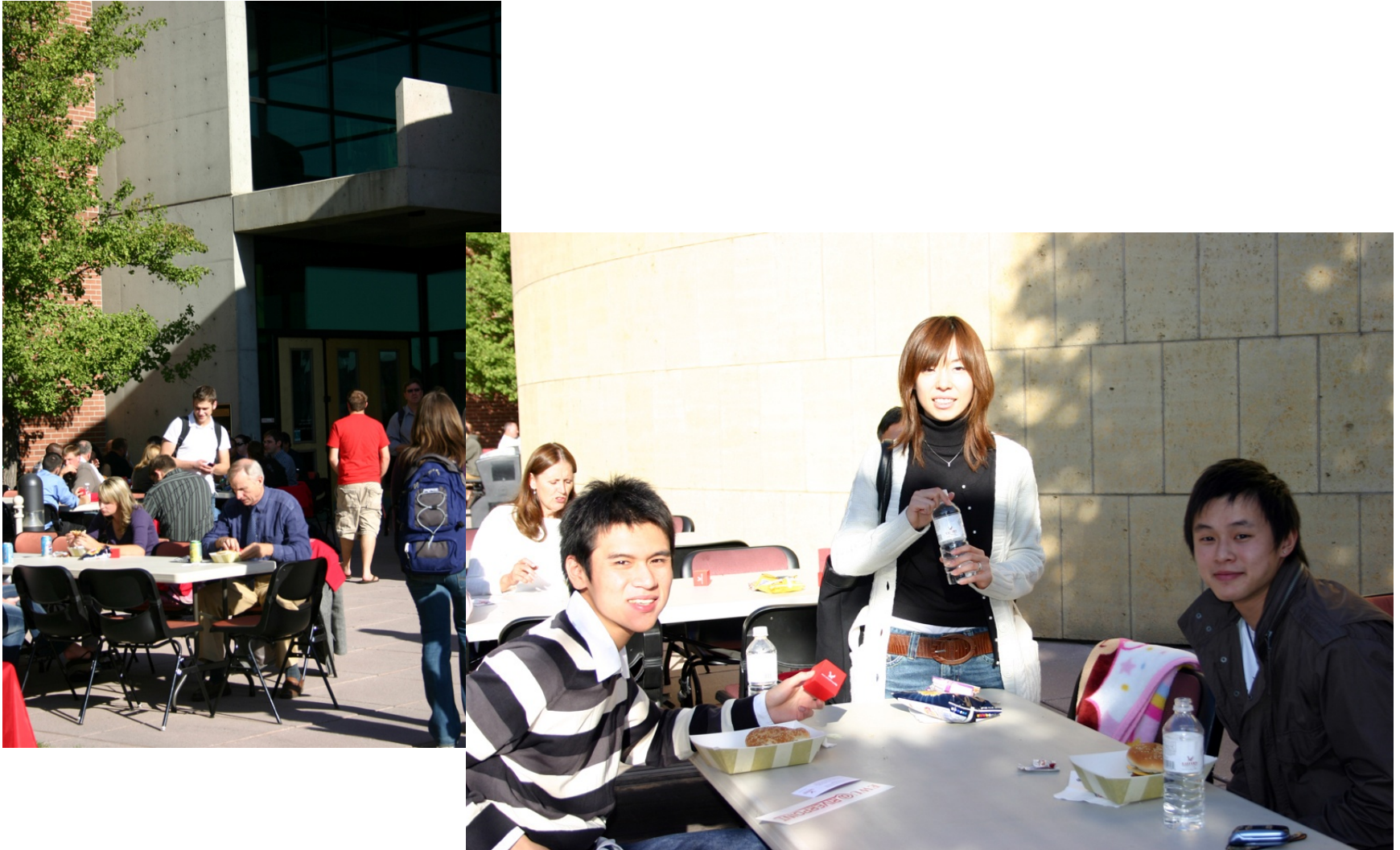
Riverpoint Campus in Spokane