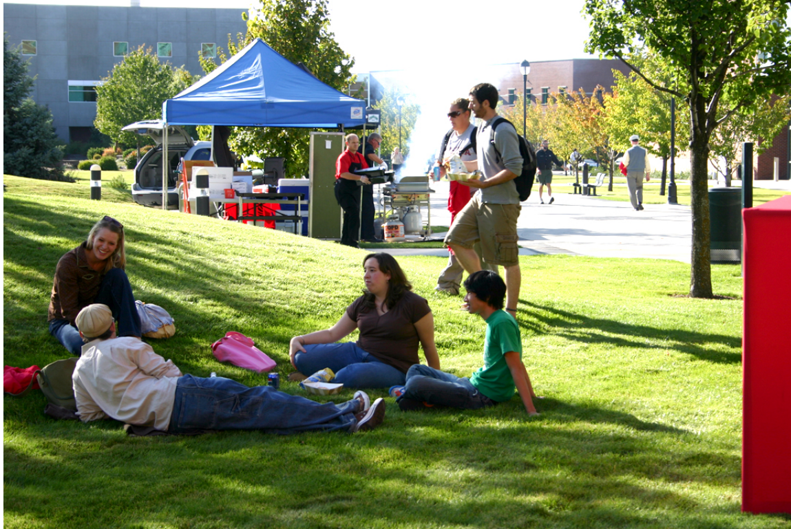
Riverpoint Campus in Spokane